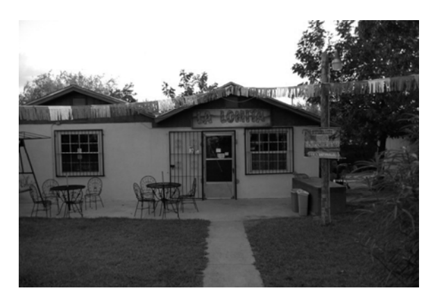
Fig. 4. La Lomita, Cienegas Terrace colonia, Del Rio, TX. ^{\rm 29}

Both Escondido Estates and Los Patos are recognized by county officials as colonias because they stand outside official city limits, identified by simple signage. Escondido Estates, stands east of the railroad tracks, where the unfamiliar visitor can miss the turn