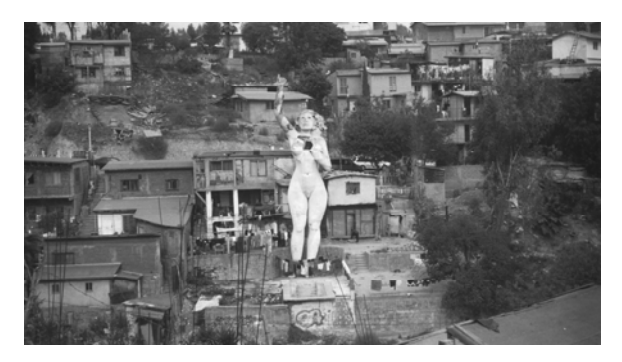
Fig. 3. La Mona, Colonia Aeropuerto, Tijuana, Baja California. ^{\rm 26}

The colonia contributes to the image of the city by generating visual links which anchor it to the larger whole. For example, in Tijuana, La Mona,<sup>23</sup> an 18-ton, 65-foot piece becomes a main marker for Colonia Aeropuerto and for the map of Tijuana (Fig.3). The cultural center, Centro Cultural Tijuana (CEUT), built in the form of a large sphere, is informally named La Bola,<sup>24</sup> while Colonia Aeropuerto's permanence is established as it gains formality, la casa de La Mona.<sup>25</sup> Hence, the colonia exists on the fringe, but it is gradually acknowledged. Despite this recognition and its intense use of density at the local scale, a colonia also becomes sprawl at the larger scale in terms of Their placement, much like the land-use. placement of the 2,000 mile fence along the border, often has no regard for the natural features of the land. Therefore, a position must be mediated between colonia as virus and colonia as bright future. The hybrid of colonia implies an evolution; it cannot exist wholly within itself, or remain stagnant in the rhetoric of Third World perceptions. If the platform for the formation of a colonia within third space originates out of the activity and juxtaposition of an urban center which requires the colonia to be pushed towards the outer ring of the city, then it cannot remain as a colonia, and as such we must look back towards the city center.