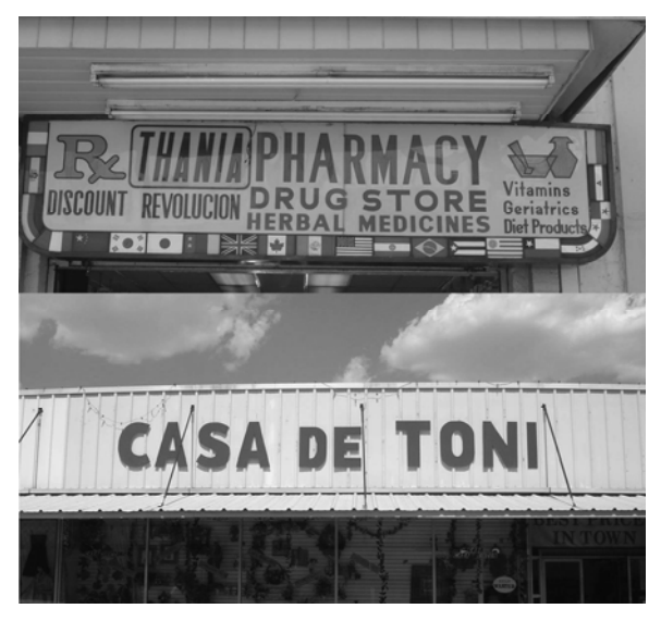
Fig.1. Top: Shop in Tijuana, Baja California, Bottom: Shop in Del Rio, Texas<sup>8</sup>

Titled, Strange New World: Art and Design from Tijuana , the San Diego Museum of Contemporary Art's 2006 exhibition was a joint effort to represent the complexity of life in the border city of Tijuana.