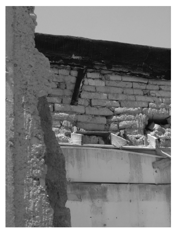
Fig.5. Adobe exposed structure, Del Rio, Texas.

The development is temporal in two manners: one, it is shaped by occupancy and vacancy, two, it is shaped by economics – as a family saves up or earns higher wages they begin to make improvements or additions over short or long periods of time. This process of constructing a colonia with the residents as self-builders leaves room for the possibilities of density at the scale of the lot or individual colonia , but falls short at the scale of the city; outside the city limits, codes need not apply, only personal needs as they arise, and additions as needed.